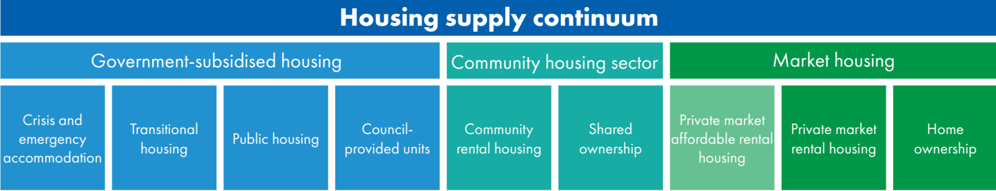
Figure 1. The housing continuum